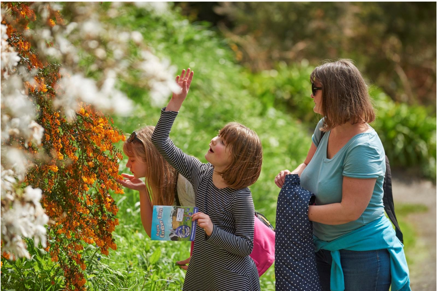
House (National Trust) near Brixham South Devon, holiday home to author Agatha Christie.

Cadbury Easter Egg Hunt at Greenway Nr Brixham, South Devon 2 April - 19 April 10.30-16.00